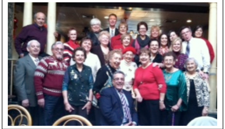
Attendees of the Christmas Party at Monte Carlo