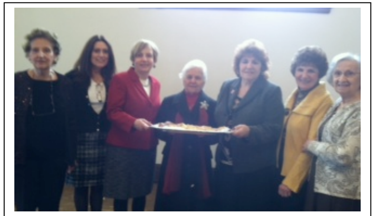
The Vasilopita bakers take time for a picture.